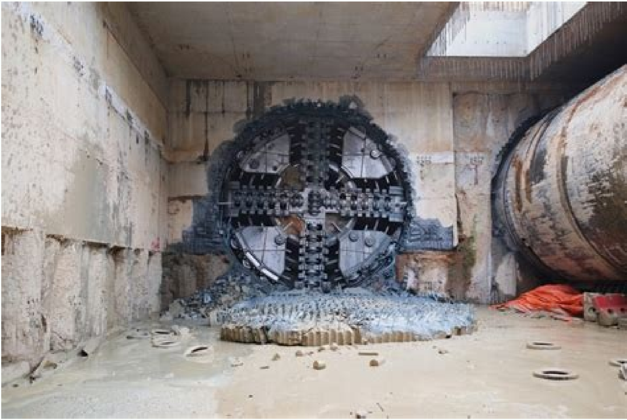
DanaInfra nasional berhad annual report.